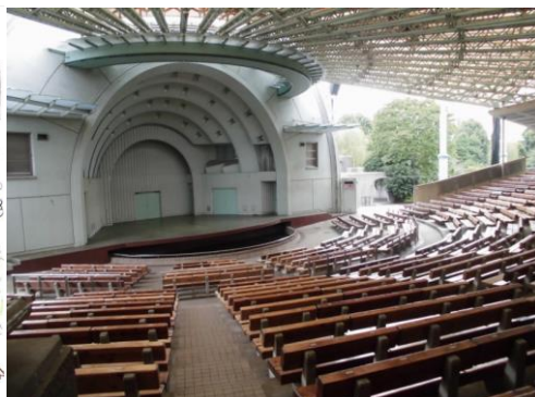
Inside of the Waterside Music Hall