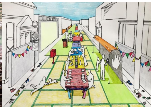
Image of the exhibition, Kashiwayu Street, Yanaka Liberated District

The Implementation Committee for New Concept “Ueno, a Global Capital of Culture” and the Arts Council Tokyo (Tokyo Metropolitan Foundation for History and Culture) will hold UENOYES Balloon Days #2 from Friday, November 23 to Sunday, November 25, 2018 in the Ueno and Yanaka areas. The event is as part of the social inclusion theme of the UENOYES project.