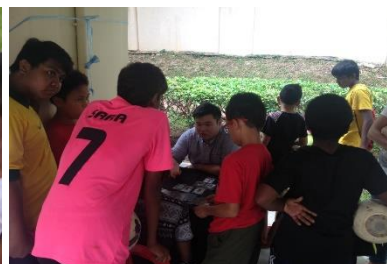
Scenes from past projects by Post-Museum